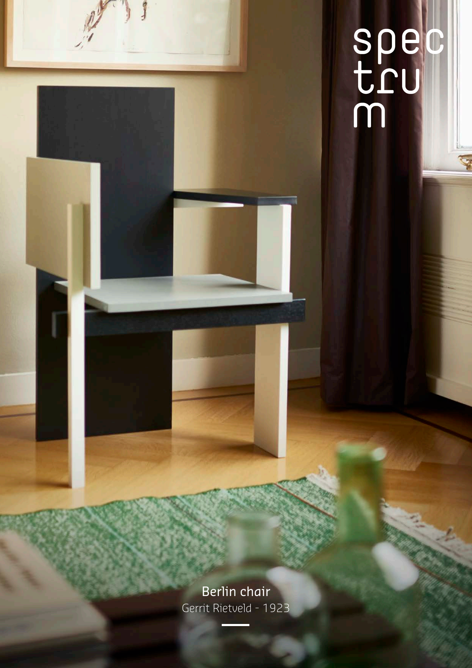
Berlin chair Gerrit Rietveld - 1923