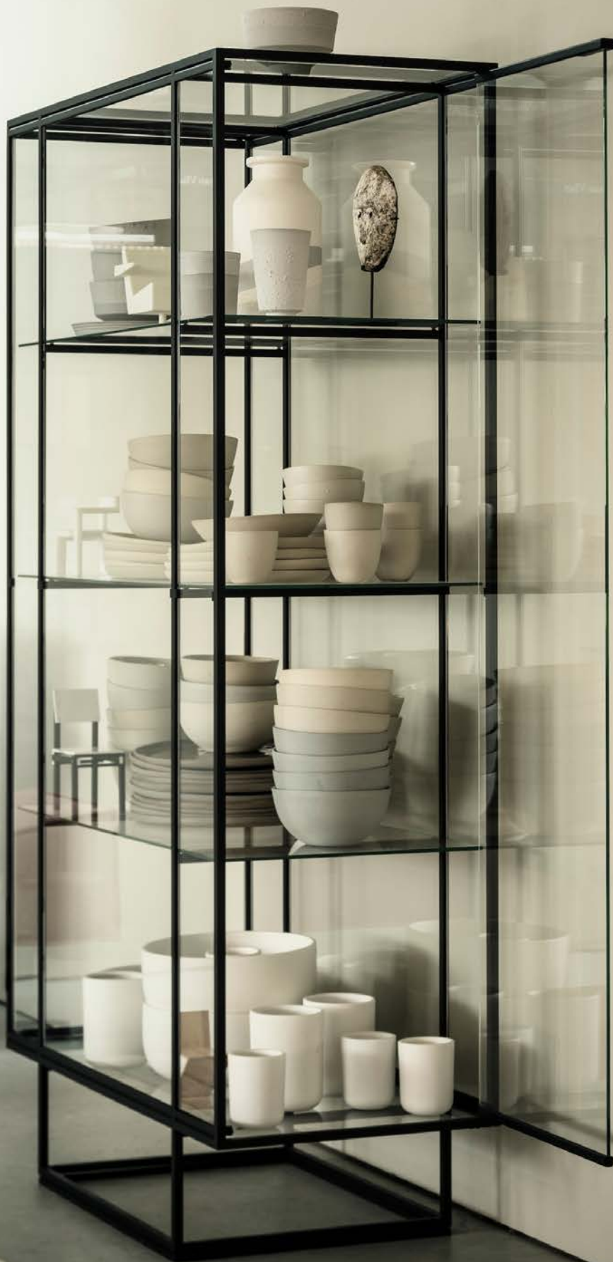
Tangled show case Carolina Wilcke - 2017