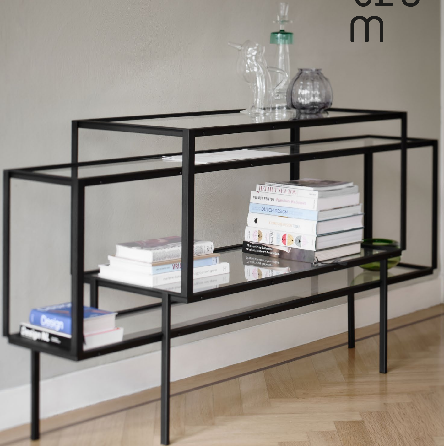
Tangled Cabinet Carolina Wilcke - 2015